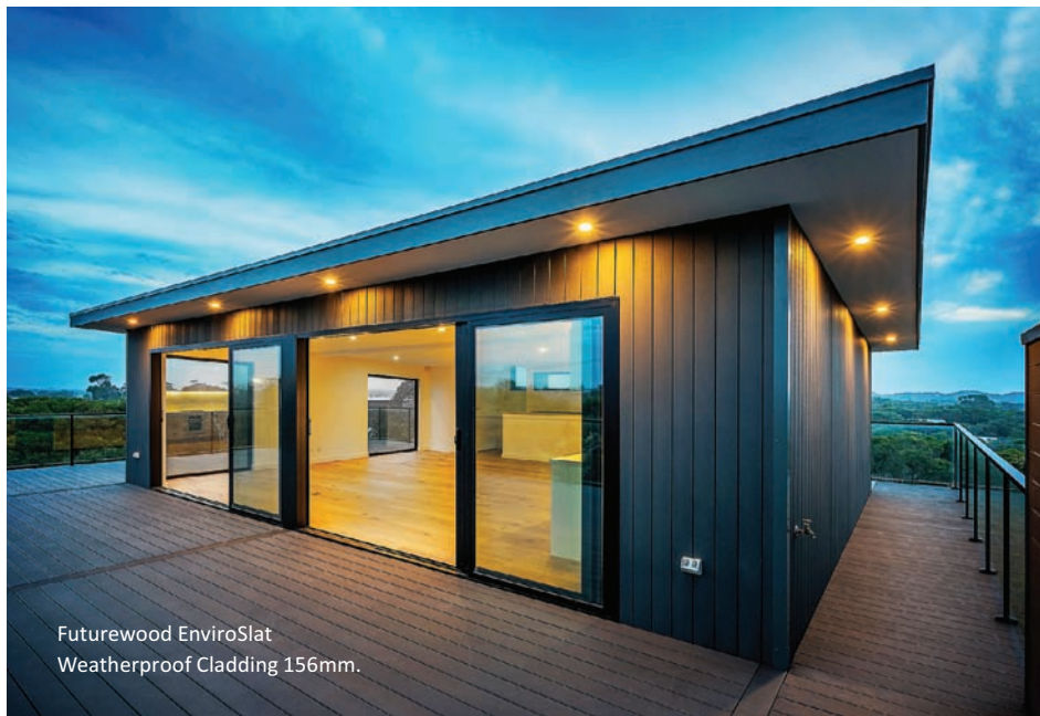
Futurewood EnviroSlat Weatherproof Cladding 156mm.