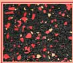
Red / Tan