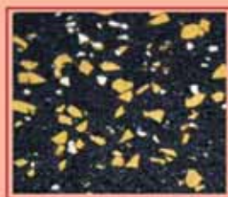
Yellow / Tan