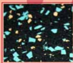
Aqua / Tan