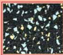
Grey / Tan